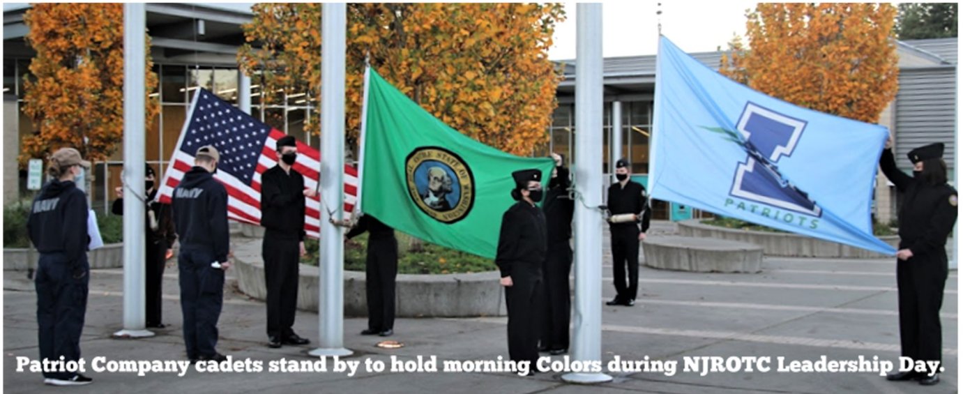
Patriot Company cadets stand by to hold morning Colors during NJROTC Leadership Day.