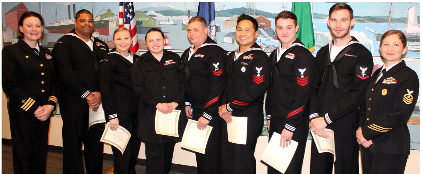
Above: Naval Reserve Center Everett left to right: