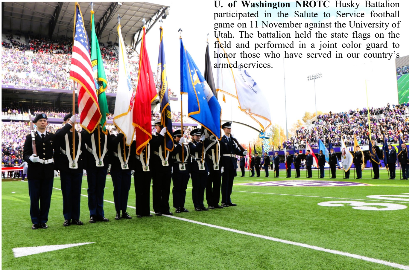
U. of Washington NROTC Husky Battalion participated in the Salute to Service football game on 11 November against the University of Utah. The battalion held the state flags on the field and performed in a joint color guard to honor those who have served in our country's armed services.