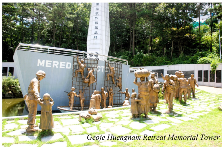
Geoje Huengnam Retreat Memorial Tower