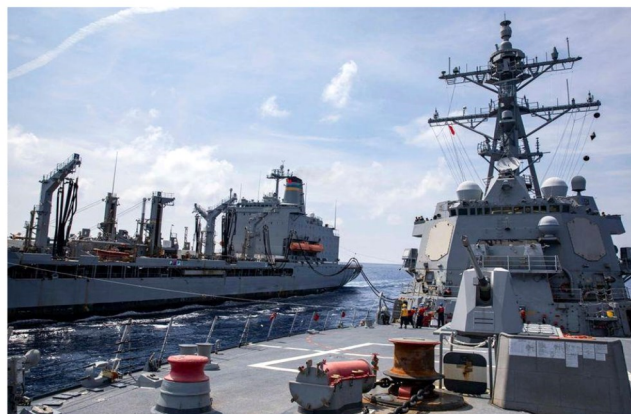
The Arleigh Burke-class guided-missile destroyer USS Ralph Johnson (DDG 114) ( above ) conducts a replenishment-at-sea with the USNS Yukon (T-AO-202) in the South China Sea.