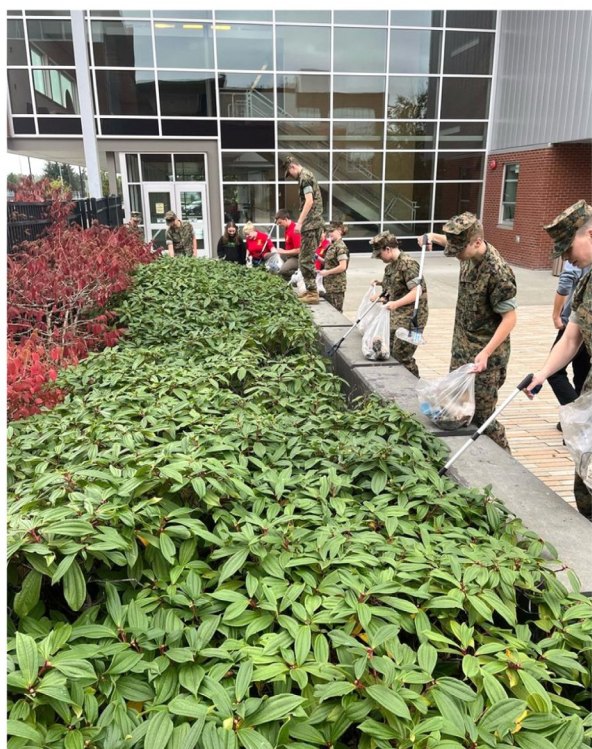
Snohomish High School Marine Corps JROTC students ( at left ) helped clean up the Snohomish High School campus in October.