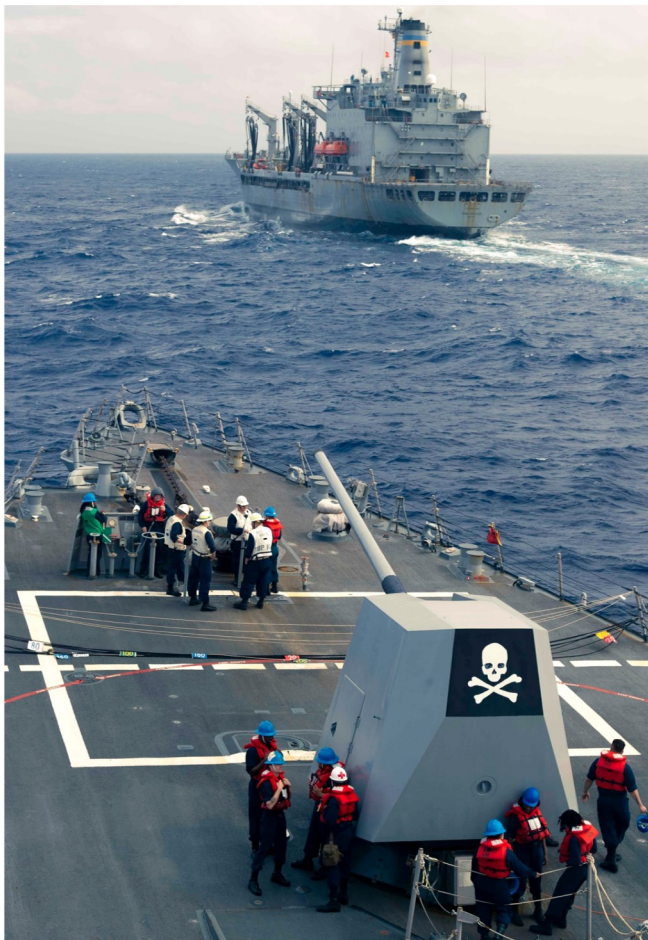
Aboard USS Kidd (DDG 100) , sailors conduct a replenishment-at-sea with fleet replenishment oiler USNS John Ericsson (T-AO 194) during a replenishment-at-sea during Multi-Large Deck Event.

Commander, Fleet Activities Yokosuka's Commadore Matthew C. Perry General Mess ( below ) hosted an open galley event for the installation's community and their guests on Thanksgiving Day 23 November 2023. More than 40 general mess staff members and temporarily assigned personnel